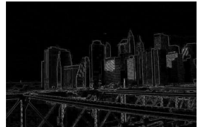
Gradient Magnitude Image