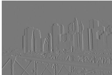
Horizontal Kernel Result