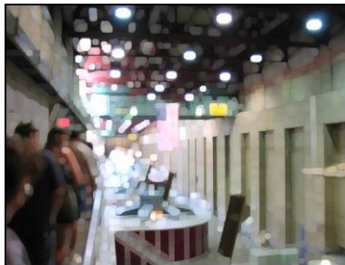
Modified by a 5x5 Dilation Kernel